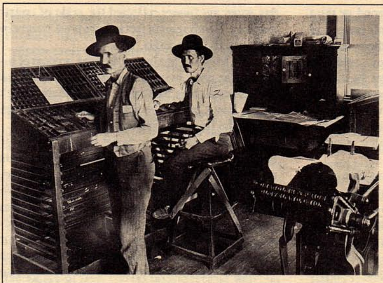
Typeslingers at the case, setting the Tahlequah Advocate, about 1900.

deaths for many of the printers (assuming it wasn't their liver which gave up first!). But the country printer took great pride in his trade, a pride which would be the needed element to sustain him through the years since seldom was the occupation itself financially rewarding.