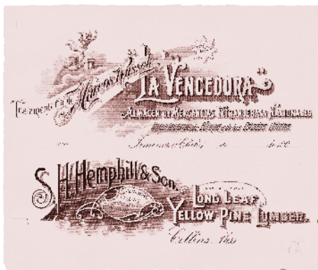
In stone lithography, the image is created in reverse directly on the stone. After the image is printed, it is removed from the stone by a grinding process, resulting in a thinner stone.

For more information on “The Color Explosion” exhibit at The Huntington Library, as well as additional photos and a view of the color poster printed for the exhibit by another Friend of the Printing Museum, Mike Patton of Creative Press, Anaheim, visit the Printing Museum's website at www.printmuseum.org . ●